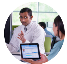
Primary or Redundant Connectivity