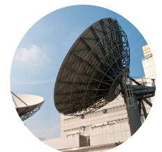
Leased Line Replacement