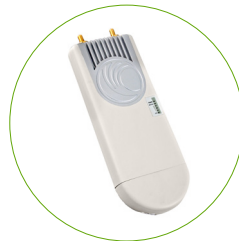
ePMP 1000 GPS Sync Radio